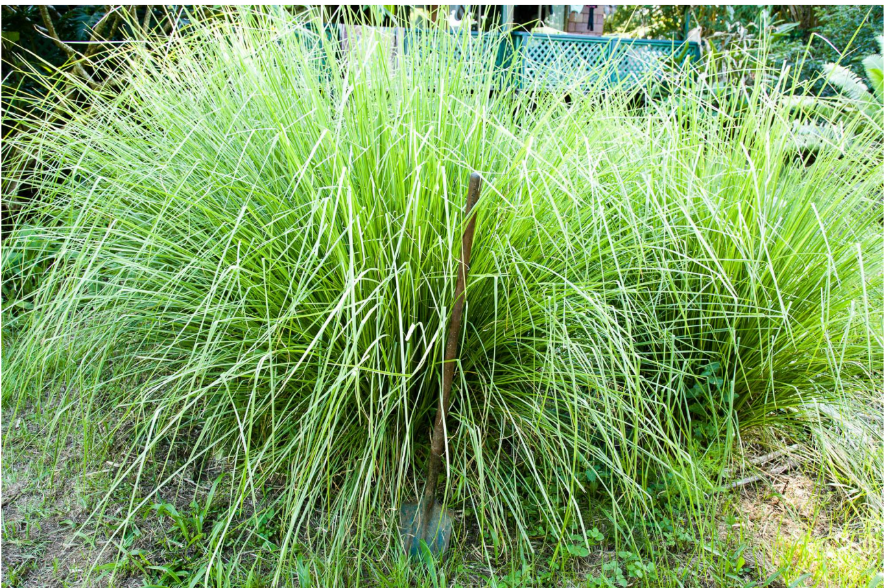
A vigorous 4 year old rainfed Vetiver clump in the author's garden with a post hole shovel for scale.

This document is a pictorial guide to one very common low cost method of propagating Vetiver for one type of application in the Vetiver System , usually unbroken hedgerows planted on or near the contour lines for soil and water conservation. For further information on propagation methods or more advanced planting applications, please visit the Vetiver Website . For updates and discussion, use the Vetiver Blog and Vetiver Facebook Group .